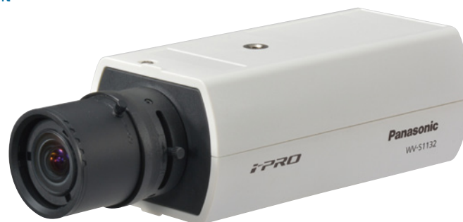
Lens : Optional